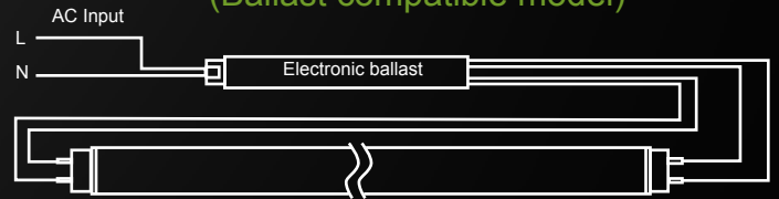
Double end LED tube (Ballast compatible model)

* No need to remove ballast. Just remove old tube and insert new one!